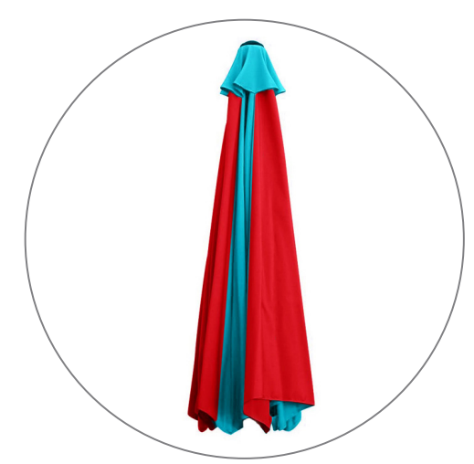
Umbrella Ribs w/Top (Top is installed prior to shipping) (qty 1)