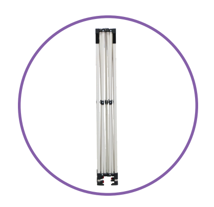
QTY 1: Frame w/ Pre-Installed Graphic

Outside Dimensions: • 11" L × 11" W × 62" H Inside Dimensions: • 10 1/2" L × 10 1/2" W × 61" H