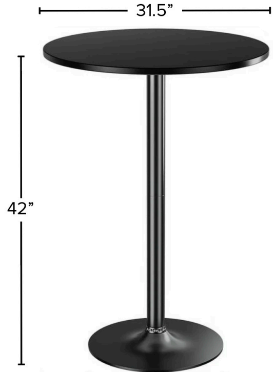
Recommended Table Sizing