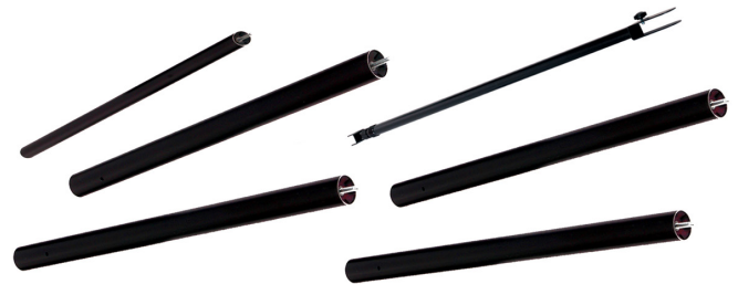
Poles for conversion kit.