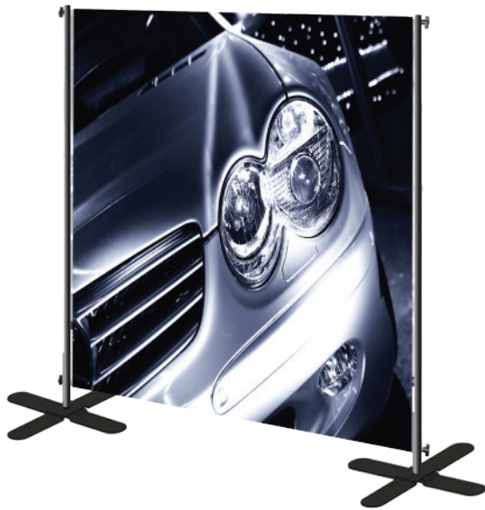
Conversion kit base stands.