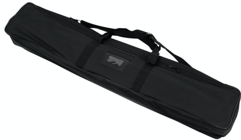
Included Travel Bag