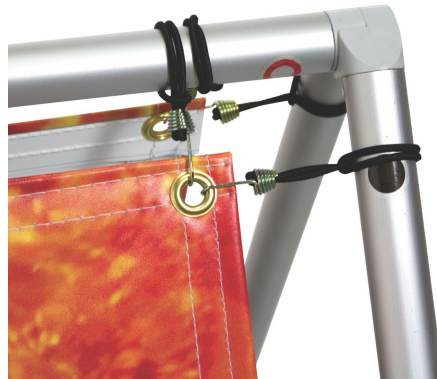
Graphic Install Close Up