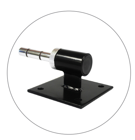
Fixed Mount - 0 Degree FAL-FM0D