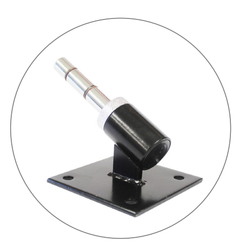
Fixed Mount - 30 Degree FAL-FM30D