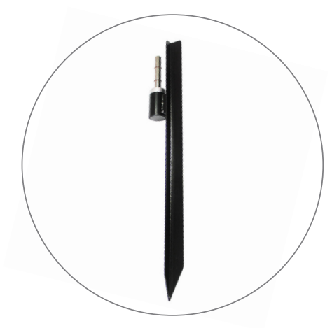
Triangle Spike Base FAL-TRI-SB