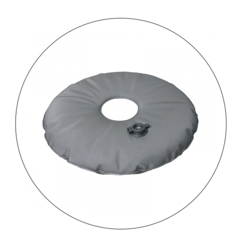
Water Bag WBAG