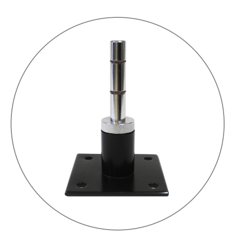
Fixed Mount - 90 Degree FAL-FM90D