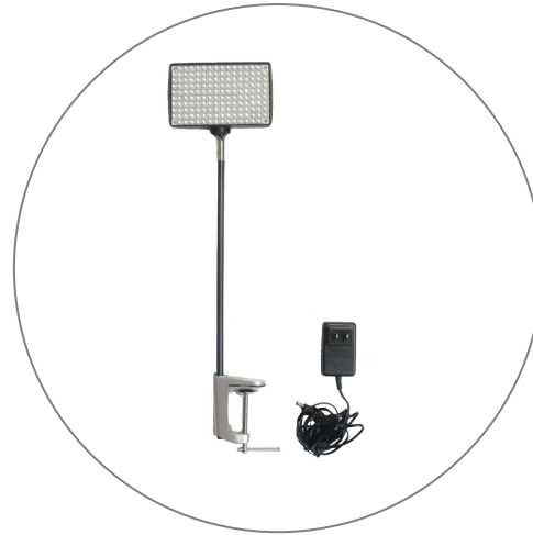
EZT-LEDBLK (qty 4) Recommended for 25ft Display