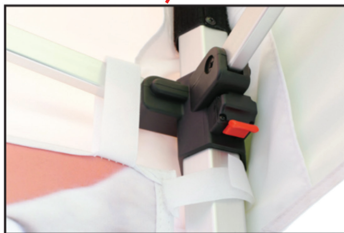
Back Wall Top & Side Straps